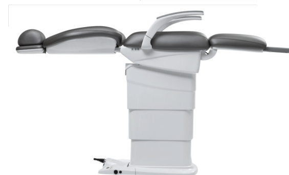
Motorized backrest height adjustment