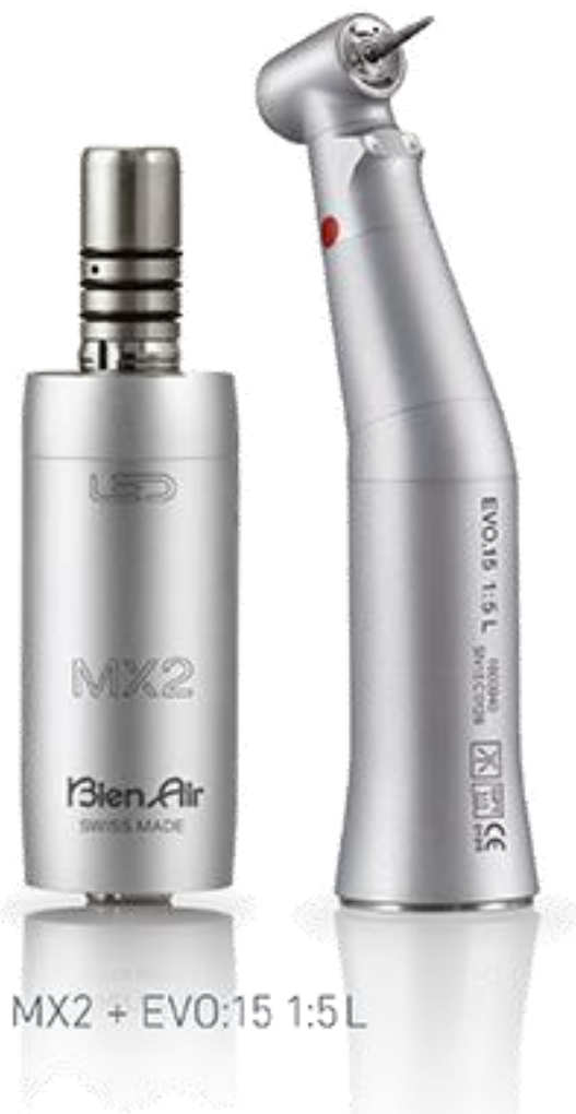
MX2 + EVO:15 1:5L

Thanks to its multiple advantages, the combination of the iOptima INT, MX2 micromotor and EVO.15 1:5 contra-angle allows you to carry out all your restorative work, from cavity preparation to finishing and polishing your filling. With advanced electronic management, the MX2 micromotor is extremely stable and powerful, even at low speed. Combined with the EVO.15 1:5's revolutionary file chuck system, this motor/contra-angle set ensures vibration-free procedure with unmatched accuracy.