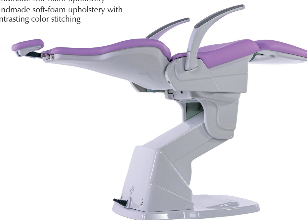
Joystick pedal control